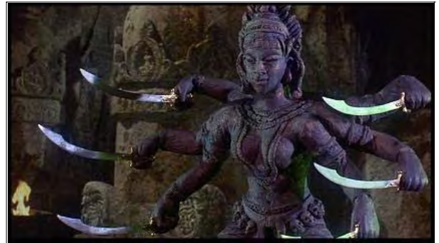
Photo of Ray Harryhausen's Kali, from "The Golden Voyage of Sinbad" ( d. Gordon Hessler, 1974)