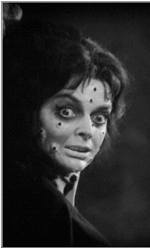
Photo of Barbara Steele from Mario Bava's " Black Sunday " (Italy, 1960)