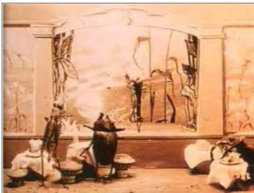
still photo from Ladislav Starewicz's "The Cameraman's Revenge" (Russia, 1912)

The famous experimental short in which everyday images form abstract patterns. The only film by the legendary Cubist painter, it is a key to all subsequent surrealist experiments in cinema.