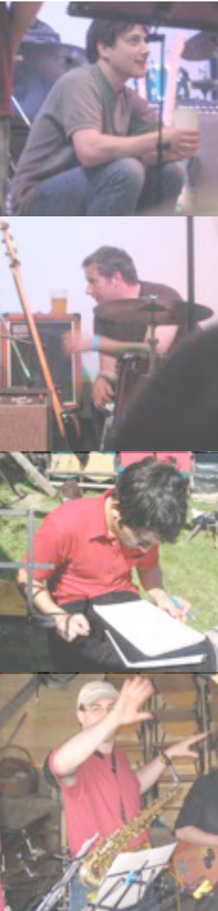
“The Wild World of Jazz” Gutbucket's Workshop in Bielefeld, Germany